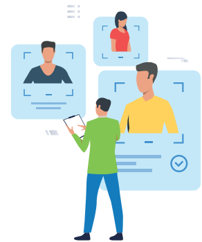
Recognize Top Team Members