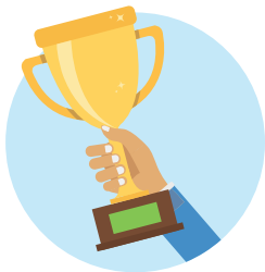
Reward Outstanding Work

Utilize the Employee Rewards Software to help strengthen your company culture, overall productivity, and results. This is the perfect tool to help retain employees, reduce costs related to turnover, improve day-to-day productivity, and in many cases dramatically enhance your employee and customers' experience. The best part, you get it included automatically when you start using the base features of the BIStrainer system.